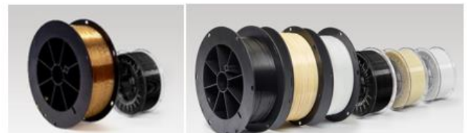
Most filaments available in 2kg and 1 kg sizes and on 1510 cc spool with EEPROM chip for use with Strataysys FORTUS® Classic printers.